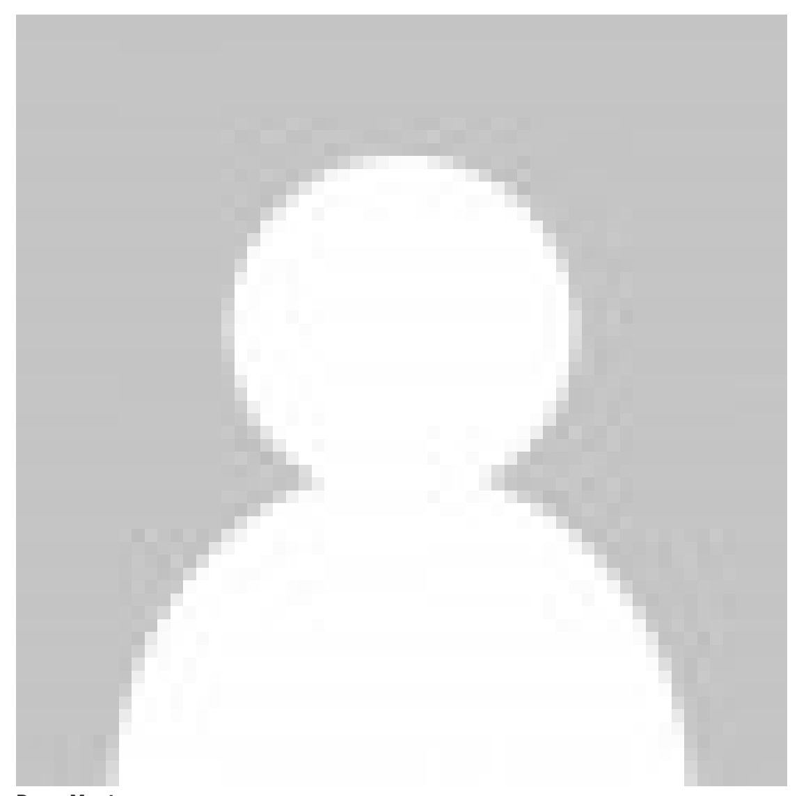
Drew Mentzer vor 9 Monaten Dark mode. Please and thank you!